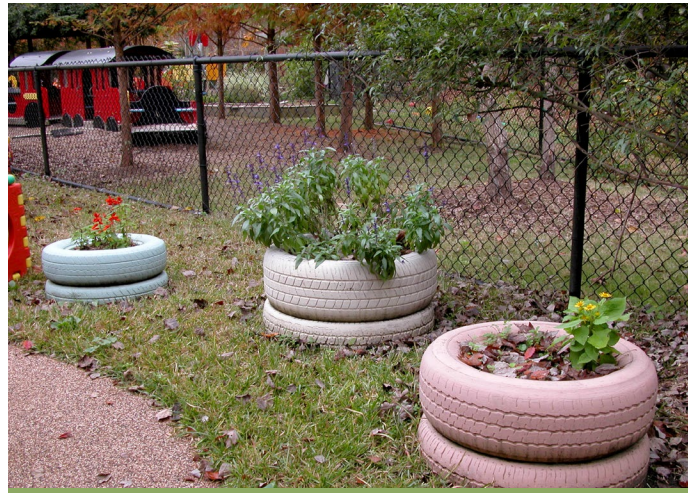
Stacked tire planters painted in light colors.

Disclaimer: The Natural Learning Initiative (NLI), NC State University, its partners, and supporting entities assume no responsibility for consequences arising from physical interventions using information contained in this InfoSheet. Under no circumstances will liability be assumed for any loss or damage, including without limitation, indirect or consequential, incurred during installation, management, and use of such interventions. Highly recommended is adherence to relevant local, state, and national regulatory requirements concerning but not limited to health and safety, accessibility, licensing, and program regulation.