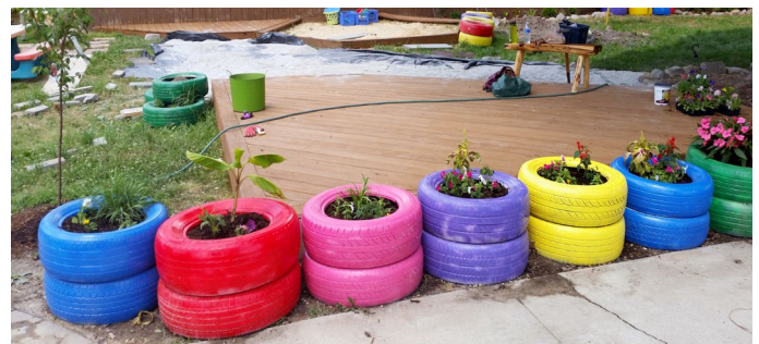
Colorful stacked tire planters act as a boundary between play settings.