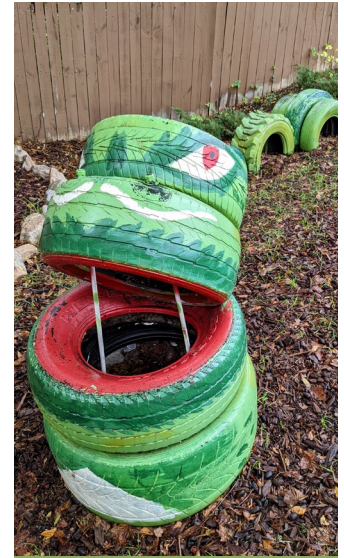
A "dragon" made from recycled tires.