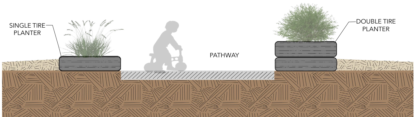
Cross section of single and double tire planters used to edge a wheeled toy, primary pathway.