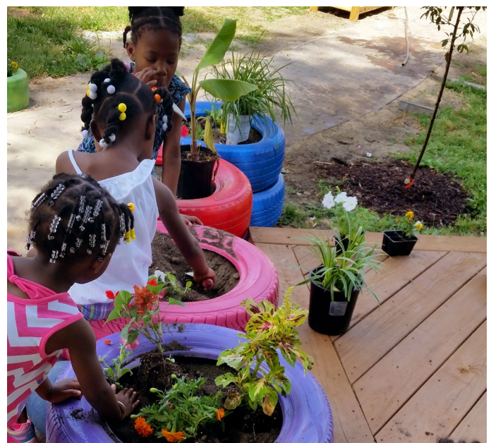
Children planting in painted tires.