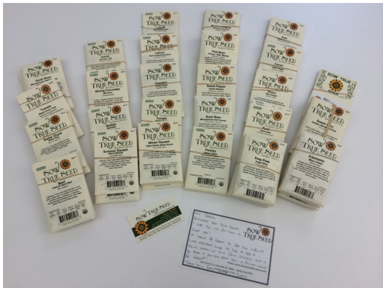
PHOTO OF THE MONTH: January garden planning results in a seed donation! Preparations are underway to create beautiful gardens at the POD-Wake centers.