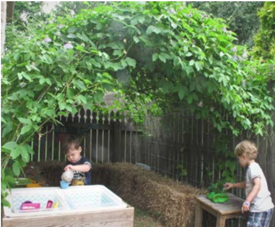
Passionflower trellis over play kitchen

It's not every day you come across a plant with such wildly extraordinary flowers as this native, flowering vine. Flowering from late spring to late summer, passionflower is an exciting addition to any garden, children's gardens in particular. This fast growing vine attracts a variety of butterflies and can quickly cover an arbor for shade during the hot summer months. We suggest planting this vine near a play kitchen, sand box, stage, or use it to naturalize a chain link fence.