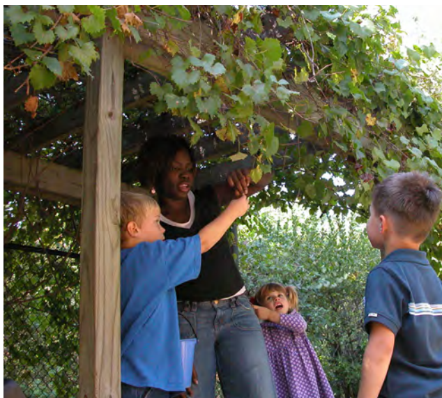
Figure 16. Fruiting plants such as grape vines provide opportunities for learning expeditions outdoors.

world by pressing against the “unknown” (see Figure 17). For children to exercise their exploratory skills beyond the known, space must be designed with soft, extendable territorial boundaries. Territorial development, natural settings, and the learning they afford focus children’s attention day after day as they progress through the school. Across successive generations experiencing a co-created landscape, children and teachers continue to evolve an outdoor culture that helps the whole school community understand their place in the universe.