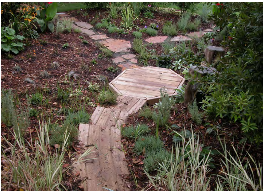
Figure 12. Rain gardens are easy to install in a wet depression. Common aquatic plants rapidly establish themselves to create a mini-ecosystem attractive to a multitude of birds and insects.