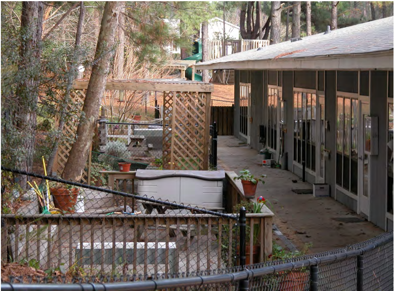
Figure 11. Transition area and outdoor classrooms. Children's House, Montessori School of Raleigh.