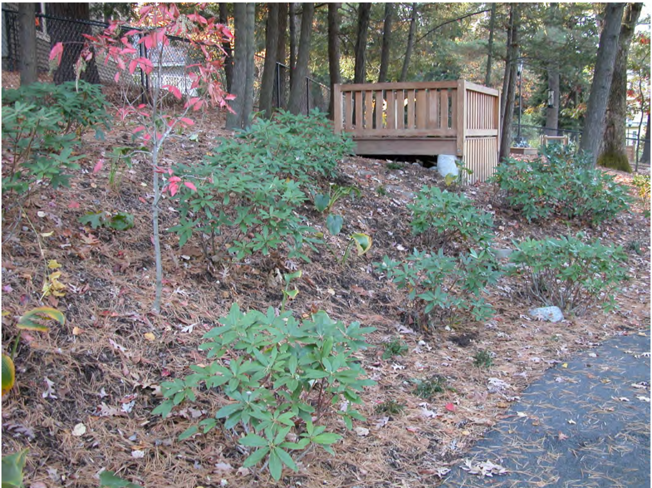
Figure 9. An elevated hillside deck offers children a commanding, secluded (yet visible to teachers) "prospect and refuge" at the Child Study Center, Wellesley College, Massachusetts. Design: the Natural Learning Initiative.

Where classrooms meet the outdoors are crucial spaces that, with appropriate design, can substantially expand the repertoire of learning activity (see Figure 11). In cold, harsh climates, winter gardens or conservatory-type glazed settings can serve as sheltered transition spaces between classroom and outdoors. Indoor plants and seedlings can flourish there for later outdoor planting. Unfortunately there are few design precedents for these types of spaces. Architects are either unaware of their importance, and/or there is insufficient collaboration between architect, landscape architect, and teachers to create them.