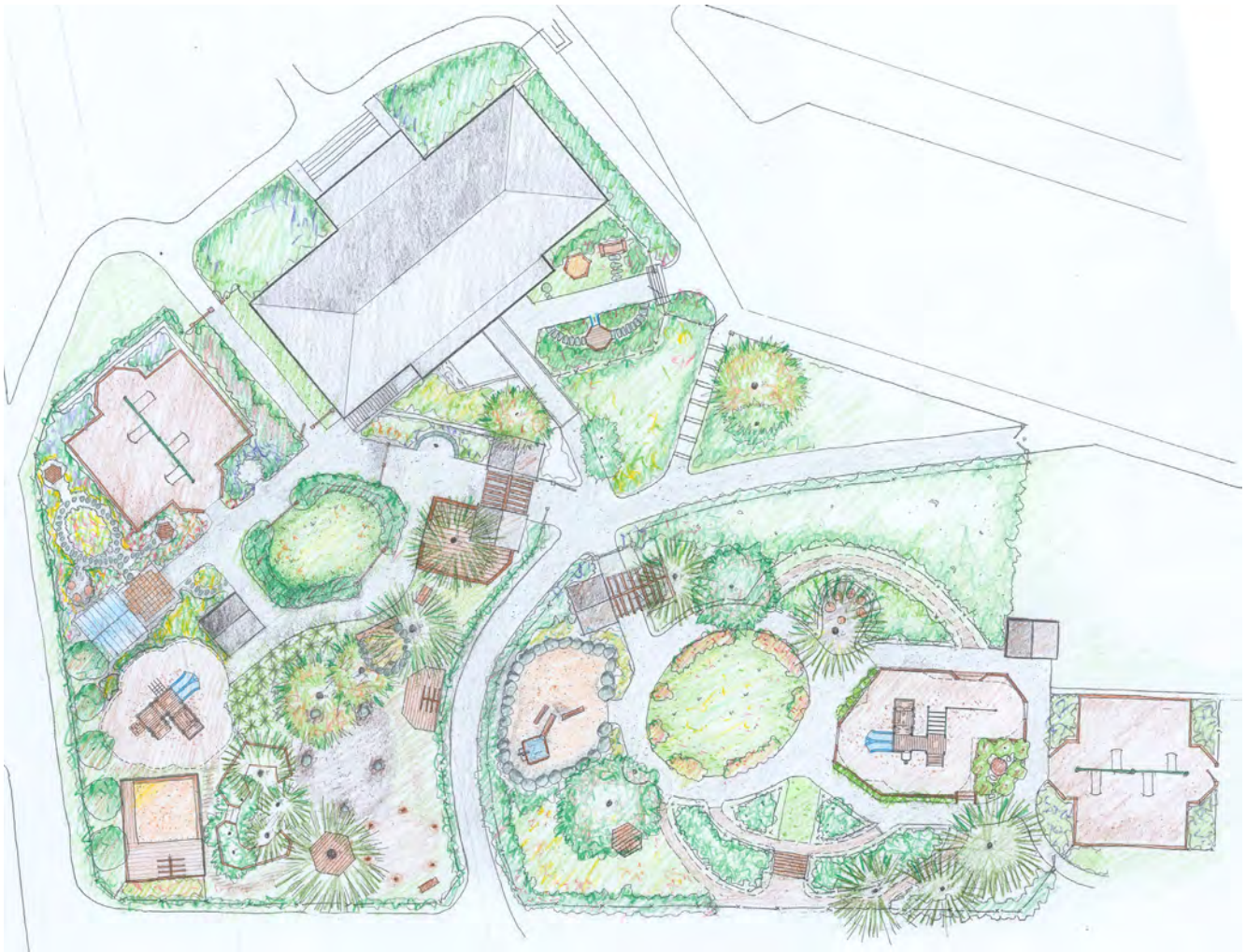
Figure 2. Layout of the renovated grounds of the Child Study Center, Wellesley College, Massachusetts. A system of looping paths links a diversity of natural settings. Design: the Natural Learning Initiative.

process, and the space must be designed to retain its lush quality.