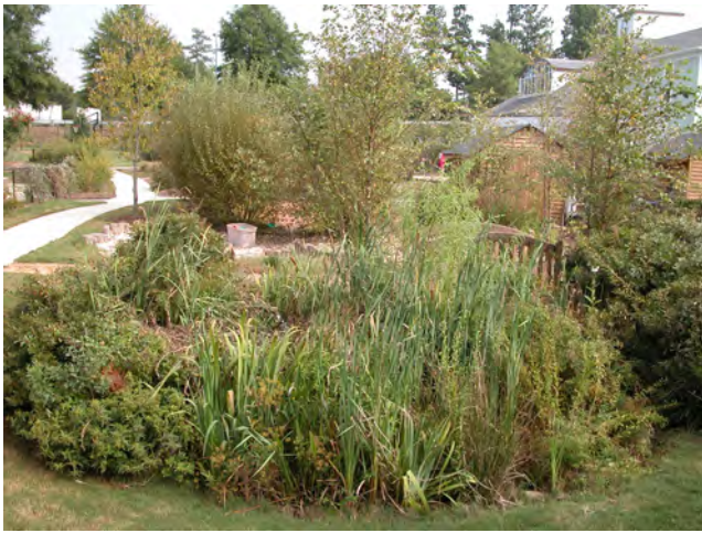
Figure 5. Vegetated swale ensures precipitation stays on site to recharge ground water to help sustain the local ecosystem.

and as a place for special study. Although enclosed for safety reasons, it can be an exciting destination for classroom field investigation trips.