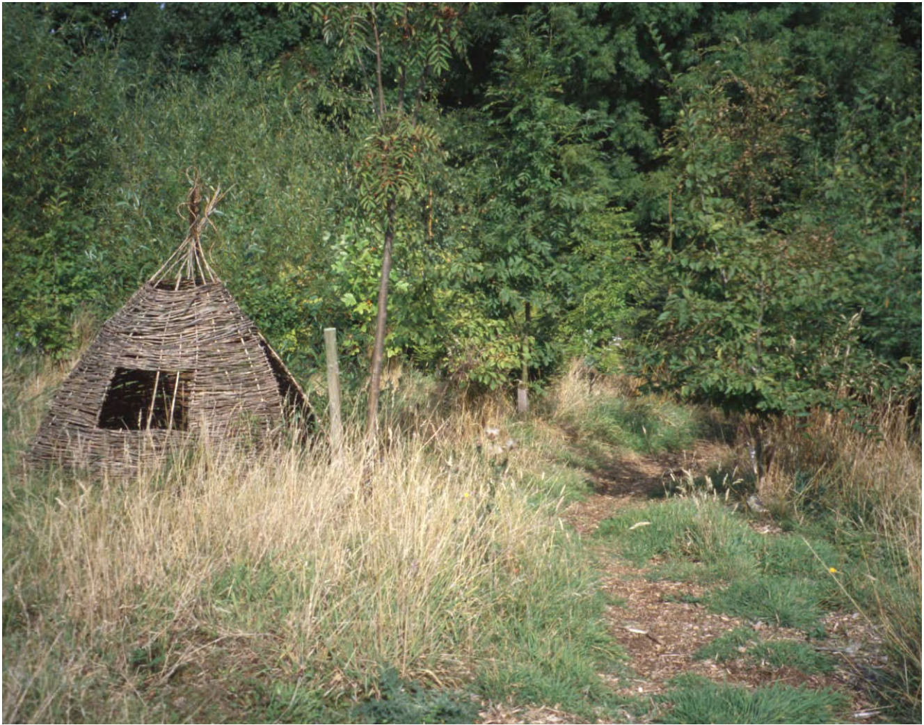
Figure 15. Rough ground in the edge of the school grounds offers learning opportunities for larger scale, hands-on projects.