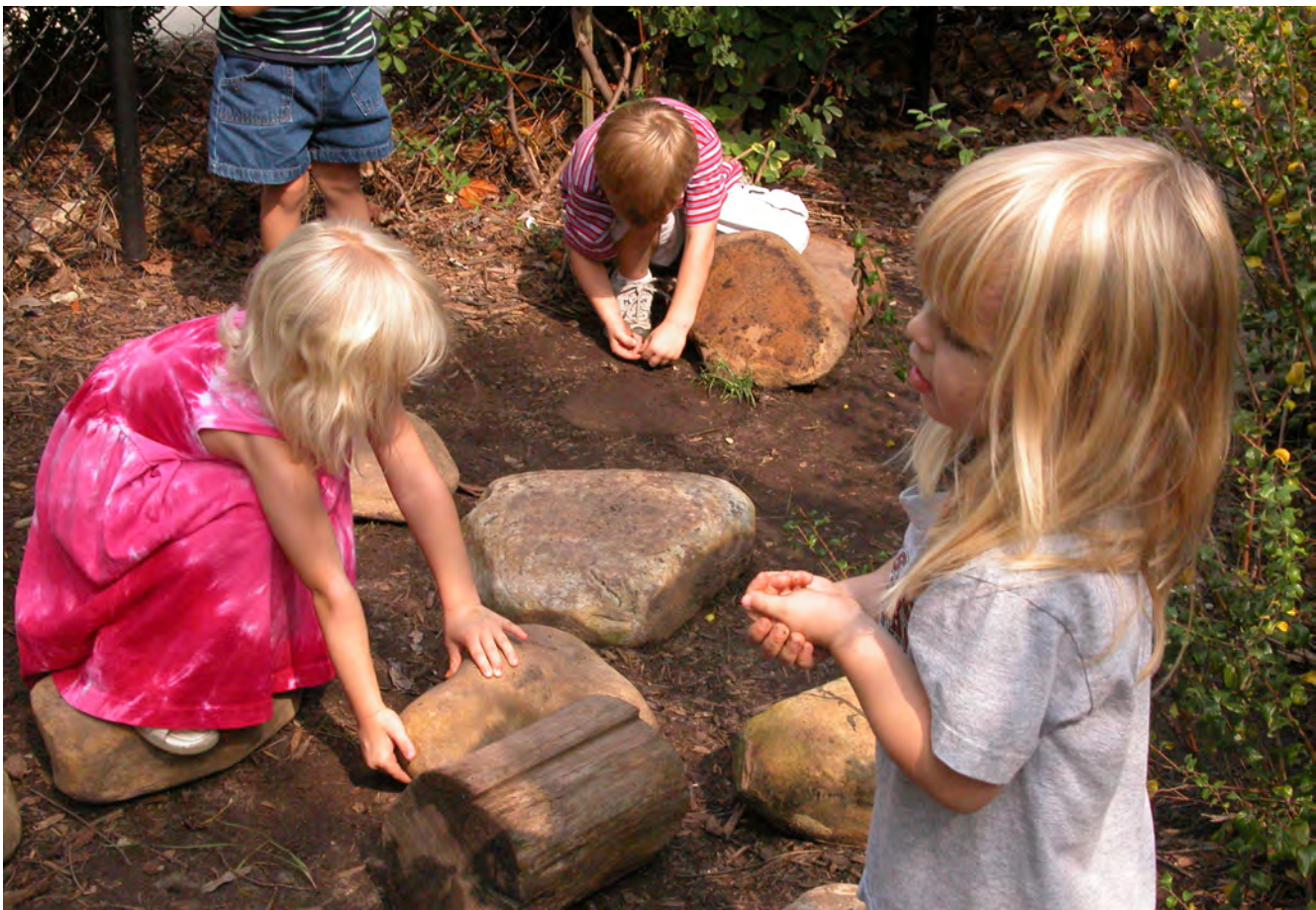
Figure 14. Moveable rocks offer children an irresistible urge to explore and discover what lives underneath.