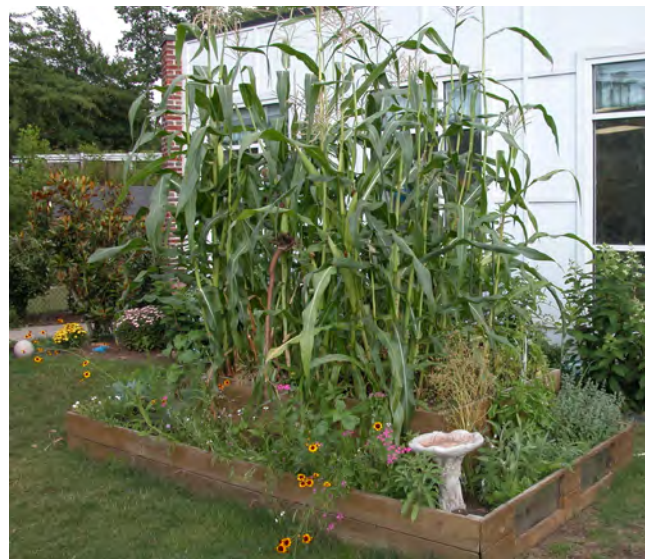
Figure 13. Easy to build multilevel learning garden. Construction above ground offers children a more comfortable, accessible working surface and provides space for higher quality planting mix.

Territorial range development recognizes that maturing individuals explore, discover, and make sense of their expanding world through experience, learned skills, and spatial understanding (Moore, "Playgrounds at the Crossroads"; Moore & Young; Hart). To maintain this dynamic relationship with the environment, children repeatedly act at their territorial limits, constantly expanding the "known"