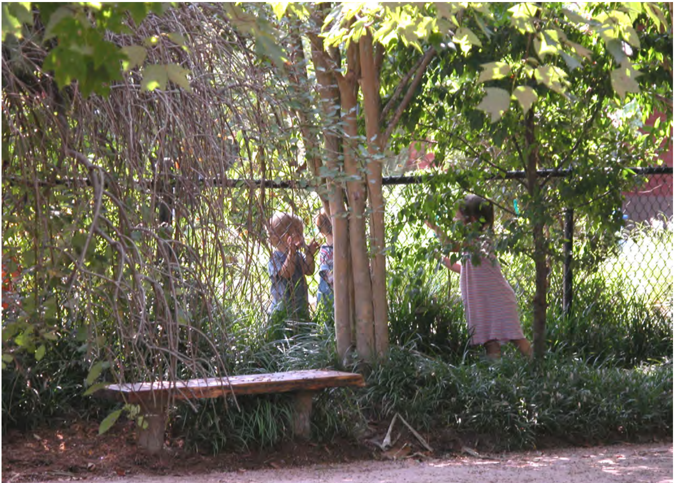
Figure 17. Children explore the edge of their known world at further reaches of their school ground territory.

with higher levels of diversity are likely to satisfy the exploratory needs of more children at any given moment. School grounds with effective territorial range development would thus hold the interest and attention of children regardless of their ability or learning style. Territorial design will similarly motivate the continuing interest of teachers who will be as excited to go outdoors as their children and feel comfortable once they are there. The greening of school grounds will then bear expected fruit.