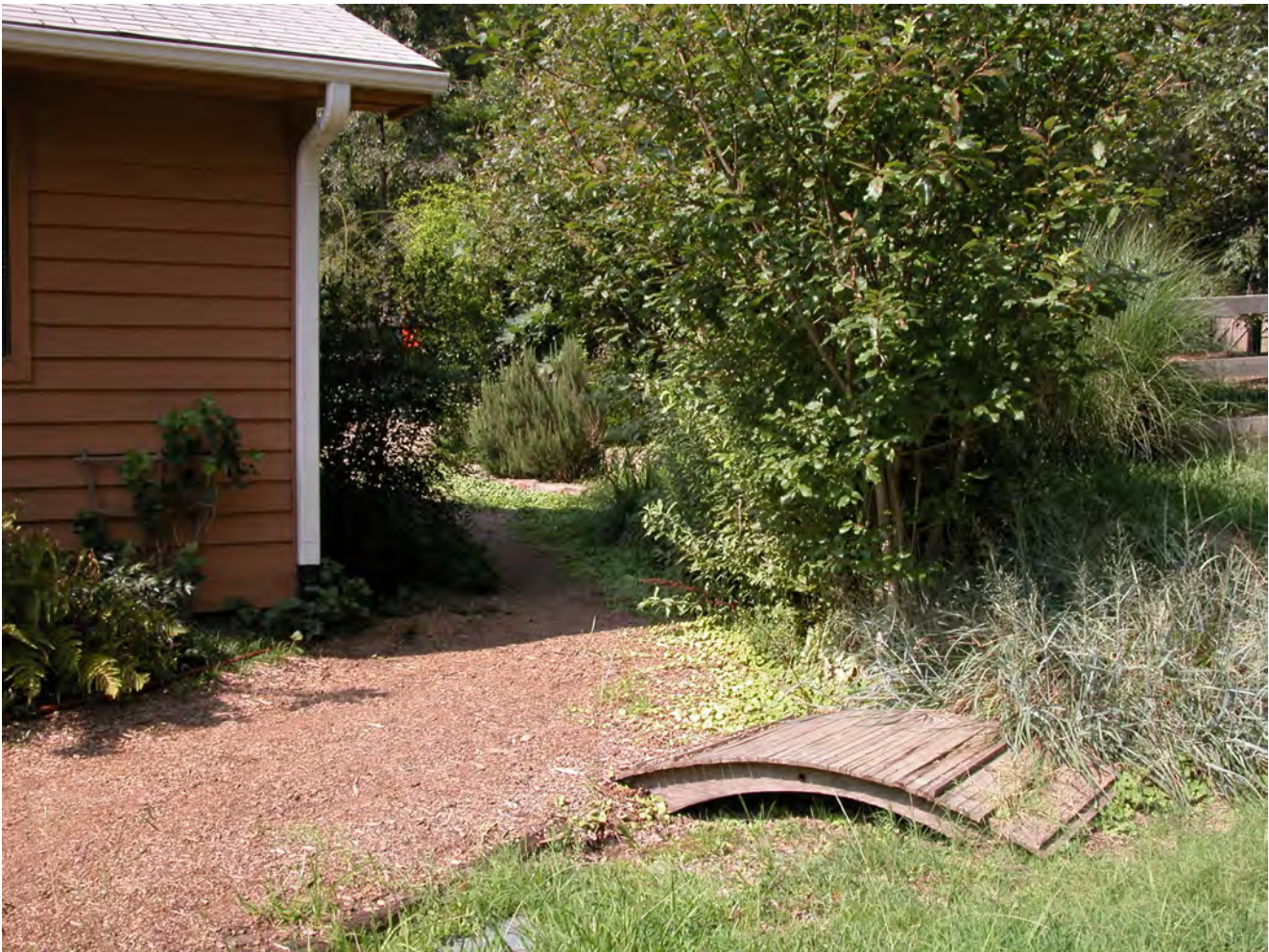
Figure 7. Soft-surfaced secondary pathway offers children daily exploration of the natural world.