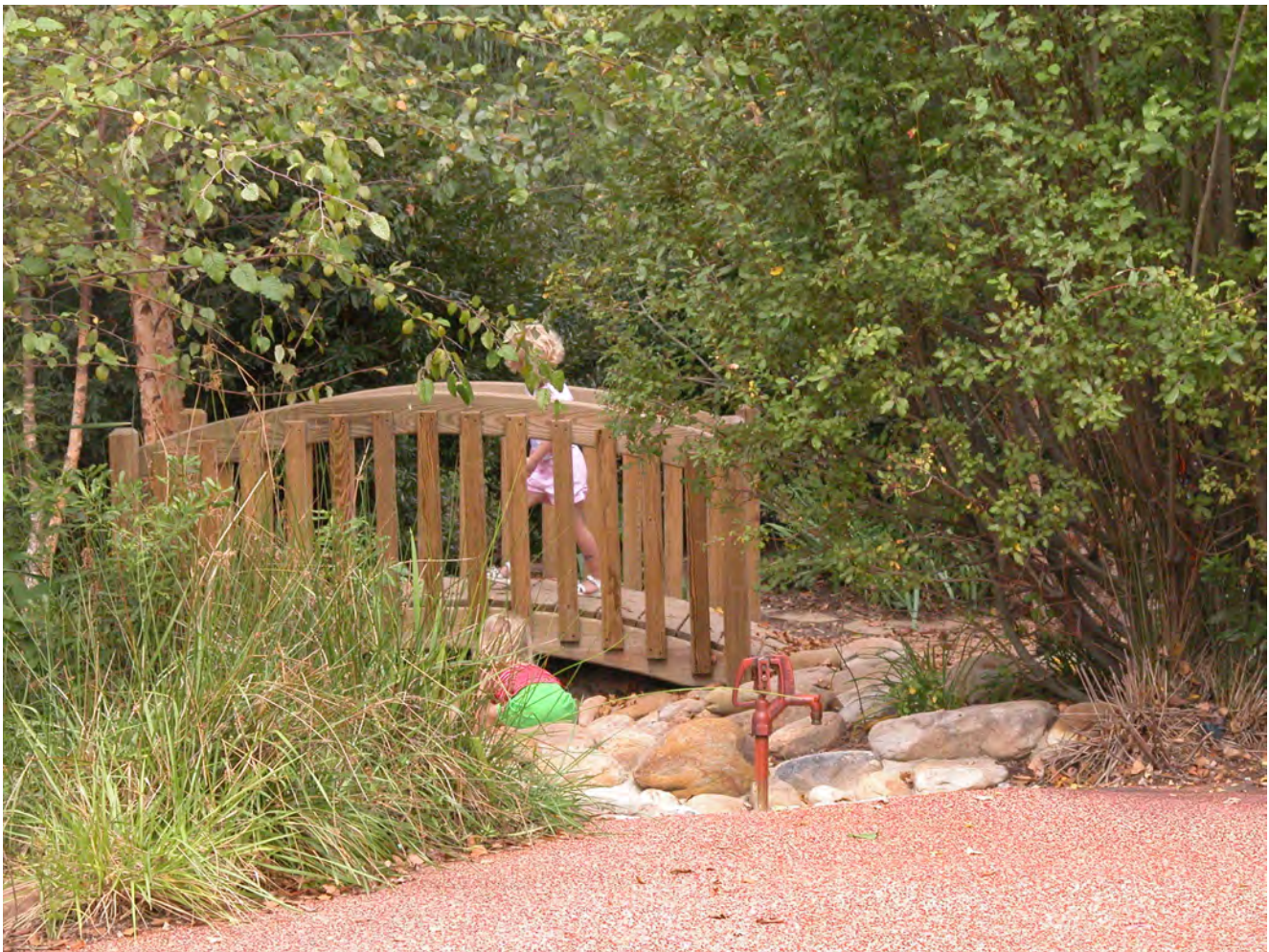
Figure 18. Landmarks offer experiential events along the way, marking the sense of an unfolding world day to day.