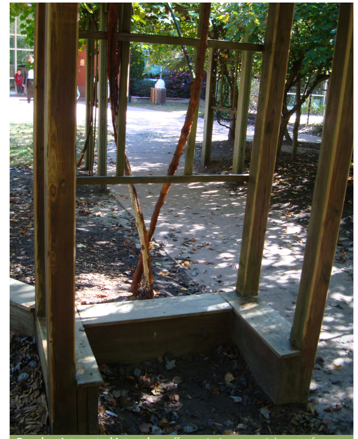
Benches integrated into arbor offer an intimate social space for a pair or trio of preschoolers.