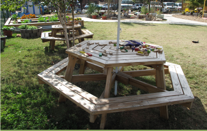
Hexagonal tables with umbrellas in quiet corner of preschool OLE support peaceful, afterschool social setting for school-aged children Hexagonal shape works better socially than rectangular.