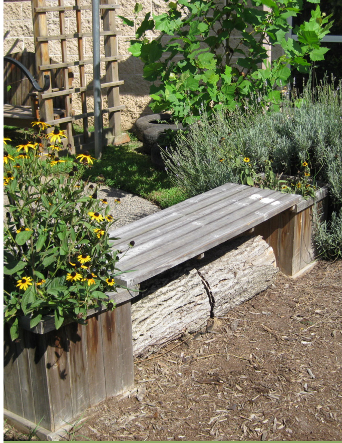
Bench between planter boxes offers a colorful, fragrant resting spot. Logs under can be rolled out for group activity.

Disclaimer: The Natural Learning Initiative (NLI), NC State University, its partners, and supporting entities assume no responsibility for consequences arising from physical interventions using information contained in this InfoSheet. Under no circumstances will liability be assumed for any loss or damage, including without limitation, indirect or consequential, incurred during installation, management, and use of such interventions. Highly recommended is adherence to relevant local, state, and national regulatory requirements concerning but not limited to health and safety, accessibility, licensing, and program regulation.