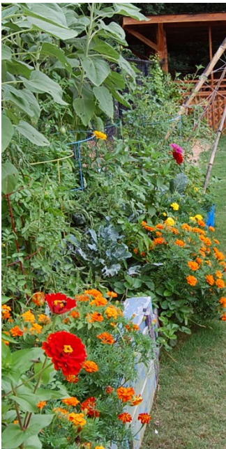
Annual flowers and vegetables are an essential of a high quality learning environment.

Individual species adapted to grow under particular conditions. Knowing some basics about how plants relate to each other and grow as a unit can guide successful plant placement. Consult a local plant expert for advice on specific growing conditions of a given site.