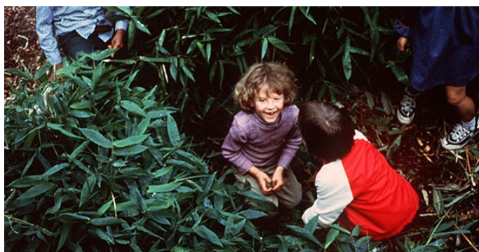
Children playing in lush, tall ornamental grasses that also provide sensory stimulation.