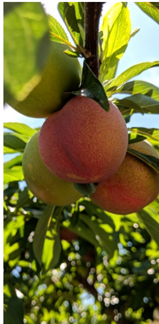
Plums ripening on a tree branch add daily interest for children.