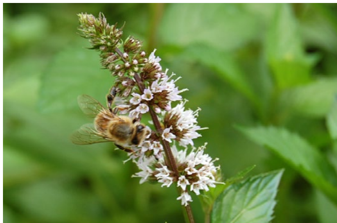
Plants bring pollinators to OLEs, benefiting the natural environment

Shrubs provide interesting foliage, flowers, and fragrance close to the ground for children to experience and enjoy. Some shrub species provide edible fruit; many attract birds, butterflies, and other pollinators.