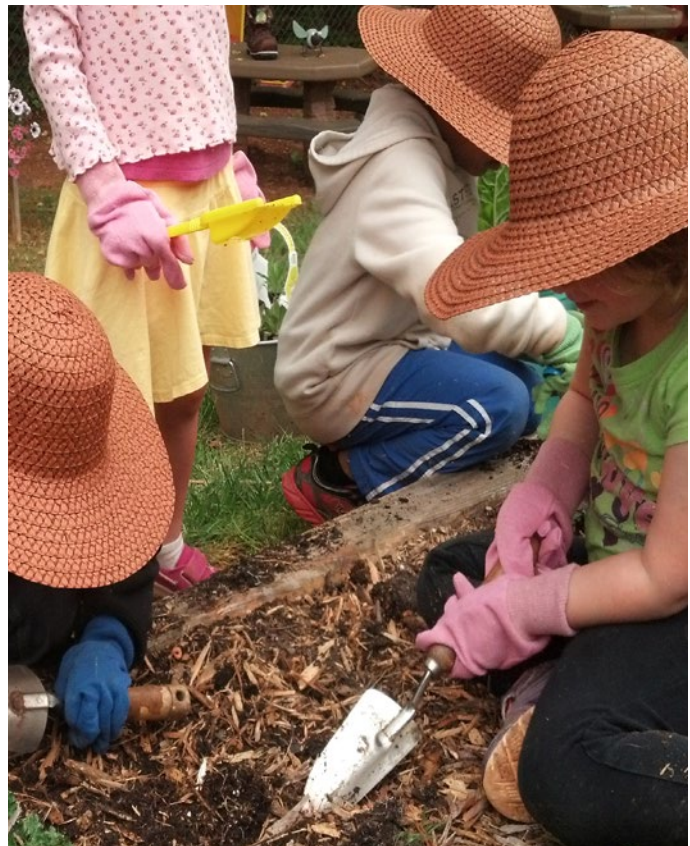
Children planting together reinforces the notion of collective effort to achieve a result that all can enjoy.

Research shows that children are more likely to try a new fruit or vegetable if they plant, grow, and harvest it. At childcare centers, edible landscapes offer the potential for children to learn healthy eating habits that will stay with them through life.