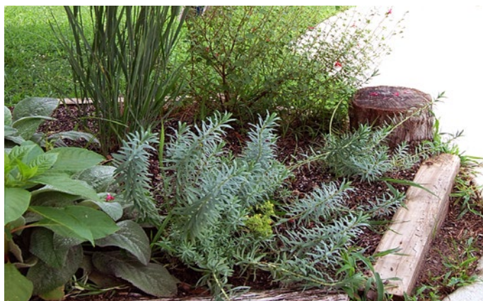
Lush perennial plantings of different textures and height add sensory interest and differentiate settings.

Trees provide shade, visual screens, and wildlife habitat. They also serve as key edible landscape components. Specific species, such as fig trees, provide climbing opportunities.