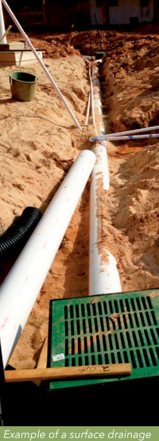
Example of a surface drainage system, which may be the only viable, long term solution.