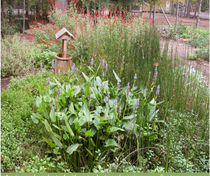
A rain garden planted with water-loving plants is an excellent management solution, attracting pollinators and adding beauty to an OLE!