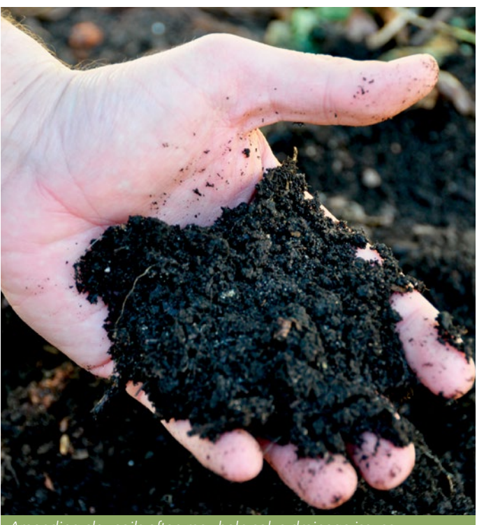
Amending clay soils often may help solve drainage issues.

Use a rain barrel. A rain barrel is a container that captures and stores rainwater drainage from a roof. Barrels usually range from 50-80 gallons and have a spigot for filling watering cans and a connection for a soaker hose. Installing a rain barrel at childcare centers will reduce water bills, minimize storm-water run-off, and model stewardship behaviors for the children that use it.