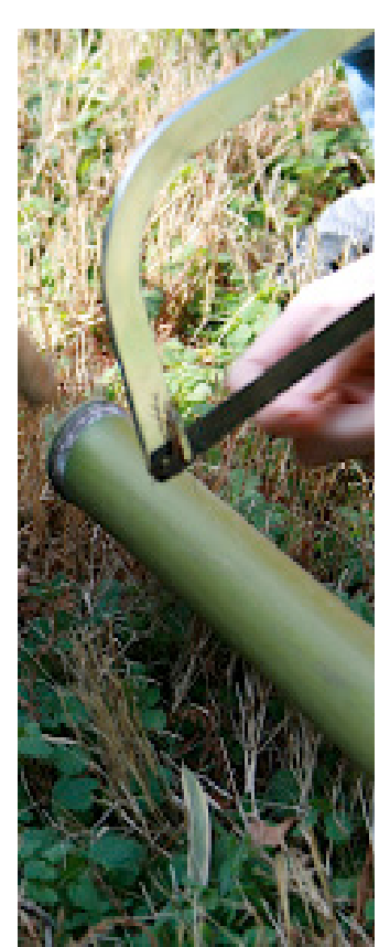
A. Cut poles to length above he cane node.

Installation requires about one hour and 2 people to assemble