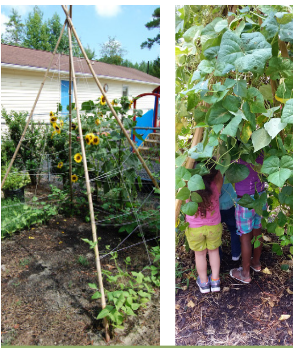
K. Plant and watch the vines grow!

Disclaimer: The Natural Learning Initiative (NLI), NC State University, its partners, and supporting entities assume no responsibility for consequences arising from physical interventions using information contained in this InfoSheet. Under no circumstances will liability be assumed for any loss or damage, including without limitation, indirect or consequential, incurred during installation, management, and use of such interventions. Highly recommended is adherence to relevant local, state, and national regulatory requirements concerning but not limited to health and safety, accessibility, licensing, and program regulation.