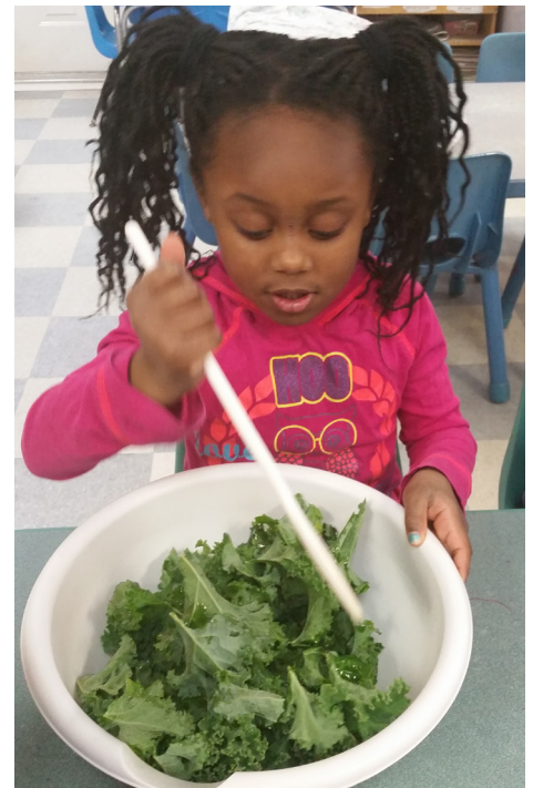
Stirring kale and dressing for a winter salad.

Fold several kale leaves lengthwise and using the point of a chef's knife, cut away the thick center stems and discard. Roll the remaining stack of de-veined leaves into a tight cigar shape and slice into strips. Alternately, have children help prepare by tearing the kale into bite size pieces. Toss the kale with the cheese and raisins. Whisk the lemon juice and olive oil in a small bowl and pour over the salad. Season with salt and pepper to taste. Let the salad sit at room temperature for 10 minutes before serving.