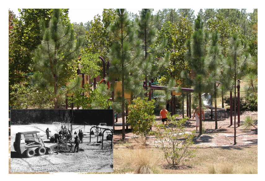
Figure 1. Re-naturing barren school sites makes them places for creative play and learning. Because children must legally attend school, society has an obligation to create attractive environments offering positive experiences for both children and teachers. Here, the native Longleaf Pine ( Pinus palustris ), was transplanted from adjacent woodland, with other species, to re-established the local ecosystem, including the endangered, endemic Red-cockaded Woodpecker ( Leuconotopicus borealis ). A school park evolved, helping students identify with their unique place on the planet. Blanchie Carter Discovery Park.

when long days and warm temperatures lure children outside more strongly. That same nature, depending on context (park, playground, schoolground, greenway, open space, vacant lot, stream corridor, etc.), may afford interactive nature play, boosting agency while supplying additional child-centric ecosystem health promotion and child development services. In low-resource urban communities, nature is a crucial missing resource. To relink childhood to independent mobility, promote health, boost agency, and secure a sense of internal locus of control, policies that support renaturing in the multitude of cities denuded during the industrial revolution is a top priority. Re-establishing urban green infrastructure may rebalance natural equity to low-resource neighborhoods, offering a double-sided, synergetic health benefit to both children (White et al., 2019) and urban biosystems.