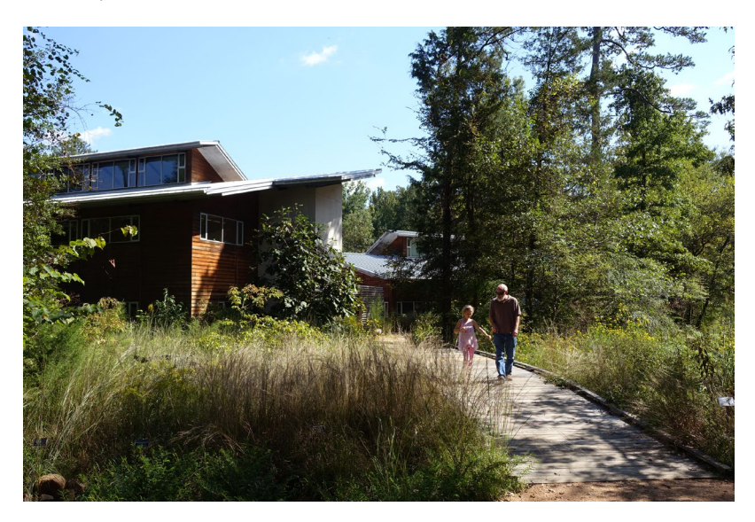
Figure 9. Nonformal education centers such as botanical gardens can be designed to be integrated with nature as "green infrastructure," attractive to people of all ages to explore and enjoy together. North Carolina Botanical Garden. Design: Frank Harmon Architect.

Supports environmental protection behaviors. Positive direct experience in the out-of-doors, beginning in the pre-literate developmental stage (Chawla and Derr, 2012, 527-555), and being taken outdoors by someone close to the child—parent, grandparent, or other trusted guardian—are factors that most contribute to individuals choosing to take action to benefit the environment as adults (Heft and Chawla, 2006, 199-216).