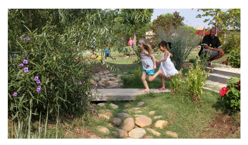
Figure 10. Nature integrated into diverse, shady, play and learning places motivates young children to move! First Environments Early Learning Center.