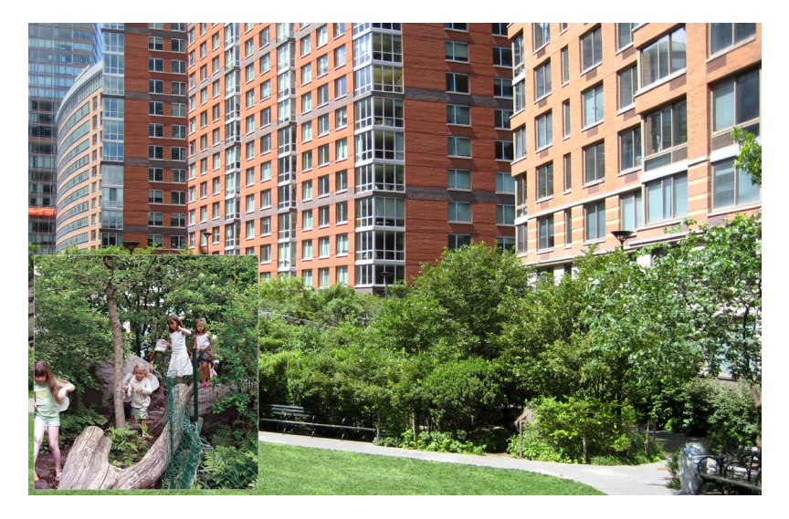
Figure 6. Teardrop Park in high density Manhattan, NYC, offers a nature playground to children of all ages, including a miniature woodland that also gathers and purifies storm water. Design: MVVA.

Focus on the everyday settings of childhood still does not match the demographic global reality of the majority of children living in cities. In the US, approximately 80% of children are urban. Until recently, buildings rarely appeared in children and nature visuals promoting the out-of-doors in the early years. More often, photos focused on scenes beyond the urban fringe, in pristine nature. A focus on socio-economic equity inevitably draws attention to the denatured everyday surroundings of low-resource communities, where renaturing could have the greatest benefit to those who need it most. Heeding the call for design practitioners to participate in the restoration process, in 2009 the American Society of Landscape Architects (ASLA) voted to create a Children's Outdoor Environments Professional Practice Network (PPN), which grew rapidly as one of the largest, active groups. Nevertheless, design professionals with a passion for creating places where children can engage with nature still find themselves constrained by economic, legal, and institutional limitations. New, interprofessional, cross-sector, hybrid implementation models are required to expand progress.