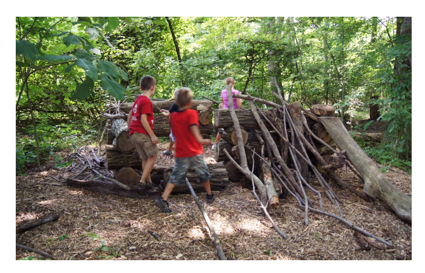
Figure 8. Small, urban woodlands with designated play settings and natural loose parts can be managed as creative play and learning spaces, attracting children to collaborate and create together. Cincinnati Nature Center.