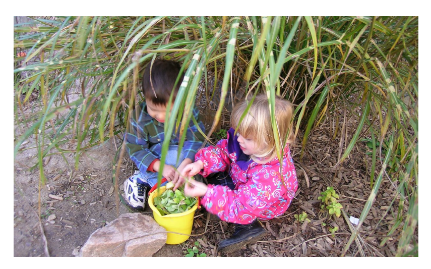
Figure 12. Small, everyday places, where young children can engage with nature together in harmony, are crucial and easy to provide. Bright Horizons Enrichment Center.

to biosphere. Associated active living habits may track through adulthood to support continuing physical health. Research results can influence public policy and regulatory systems to intentionally support health-promoting design and management. Objective, detailed knowledge may guide built-environment design standards and related risk management protocols.