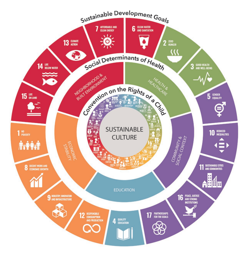
Figure 5. Sustainable, equitable, global culture is supported by three realms of international policy. Foremost is the Convention on the Rights of the Child (inner ring), an international treaty with 42 Articles mandating basic child rights; Social Determinants of Health , defining 5 key areas influencing human health and equity; and 17 Sustainable Development Goals , 10 of which UNICEF is custodial for, including early childhood development.

Recognizing young children as critically significant for sustainable development. Until recently, environment and behavior research titles with the word "people" almost never included children under five years old; thus, early childhood research instruments and methodologies are more likely to be adapted versions of those used with school-age populations. Although relatively rare, school-age studies are advancing, particularly in health-related research. Explicit links to Sustainable Development Goals