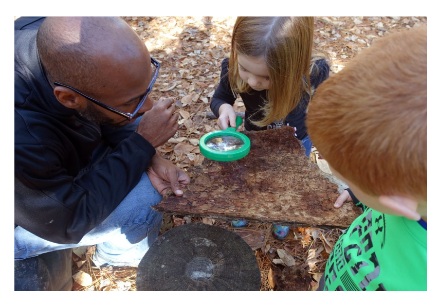
Figure 4. In a small, remnant, urban woodland, young children explore life on a piece of dead bark on the ever changing forest floor. An enthusiastic teacher asks questions and guides the conversation. First Environments Early Learning Center.