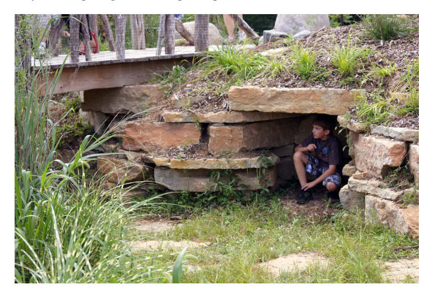
Figure 7. Cave-like places embedded within the surface of the Earth fascinate and shelter children and stimulate hide-and-seek games. Cincinnati Nature Center.

City-scale renaturing may also serve environmental equity by addressing the legacy of denatured neighborhoods created during the industrial era, especially in low income areas. Post-industrial development in the last few decades has seen many encouraging examples of nature restoration to barren urban lands. Although a new era of urban landscape restoration is underway, sites are often large, politically viable but located far from the daily lives of children. As the planet continues to urbanize, selected "nearby nature" or neighborhood common lands could be conserved or restored where children live, instead of becoming "urban infill" sites. Restoration of nature to the everyday spaces of early childhood is a nature-based solution, remediating a social determinant of health, offering hope to communities, supported by all who care about children's healthy development. A note of caution: the process of upgrading environmental quality, including re-naturing of living spaces, can easily lead to rising land values and gentrification that displaces the population intended to benefit (Maantay and Maroko, 2018). Solving this conundrum may well require government participation in the real estate market.