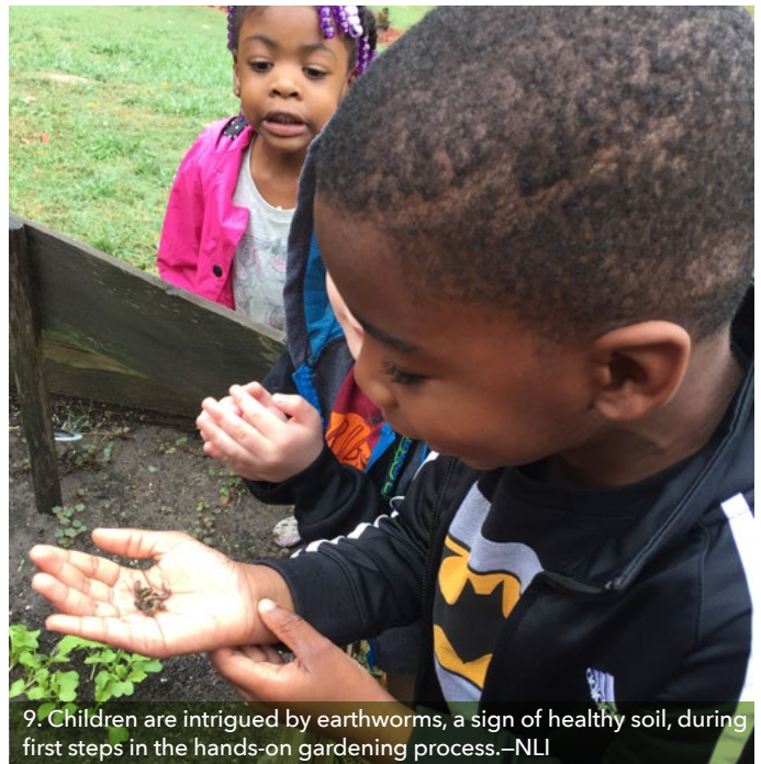
9. Children are intrigued by earthworms, a sign of healthy soil, during first steps in the hands-on gardening process. –NLI