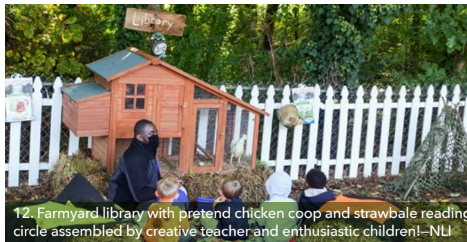
12. Farmyard library with pretend chicken coop and strawbale reading circle assembled by creative teacher and enthusiastic children!—NLI

Innovative play and learning programming can help providers engage children in new outdoor settings for longer periods of time (12). Especially in response to COVID-19, providers may benefit from supportive training, tools, and resources to encourage spending more enjoyable time outside during a substantial part of the day. Online professional development support such as webinars, trainings, and networks of practitioners are available through ECHO and NLI (13).