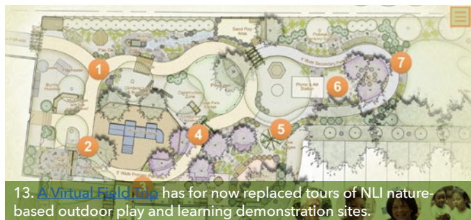
13. A Virtual Field Trip has for now replaced tours of NLI nature-based outdoor play and learning demonstration sites.