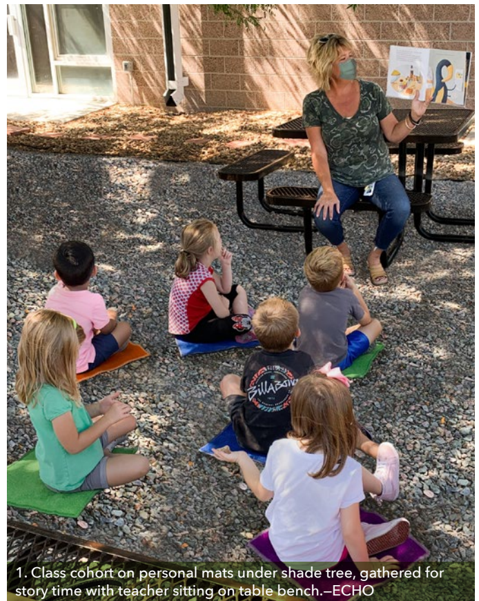
1. Class cohort on personal mats under shade tree, gathered for story time with teacher sitting on table bench.—ECHO

establishing stable groups of children and adult(s), called cohorts. This approach aims to prevent mixing between groups while allowing for social interaction within groups. It can be combined with time outdoors adhering to local or state guidelines for personal protective equipment and sanitation (1).