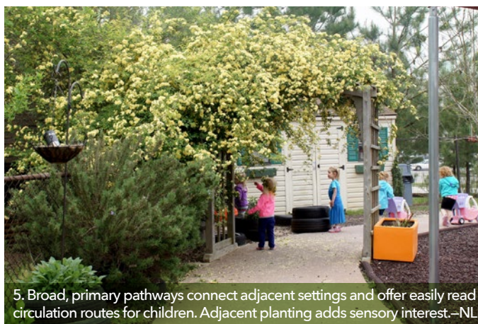
5. Broad, primary pathways connect adjacent settings and offer easily read circulation routes for children. Adjacent planting adds sensory interest.—NLI