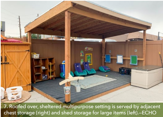
7. Roofed over, sheltered multipurpose setting is served by adjacent chest storage (right) and shed storage for large items (left). –ECHO