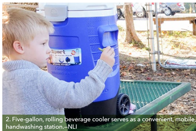
2. Five-gallon, rolling beverage cooler serves as a convenient, mobile, handwashing station.—NLI