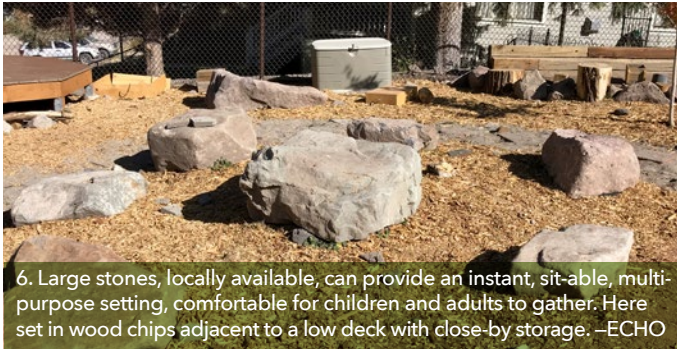
6. Large stones, locally available, can provide an instant, sit-able, multi-purpose setting, comfortable for children and adults to gather. Here set in wood chips adjacent to a low deck with close-by storage. –ECHO