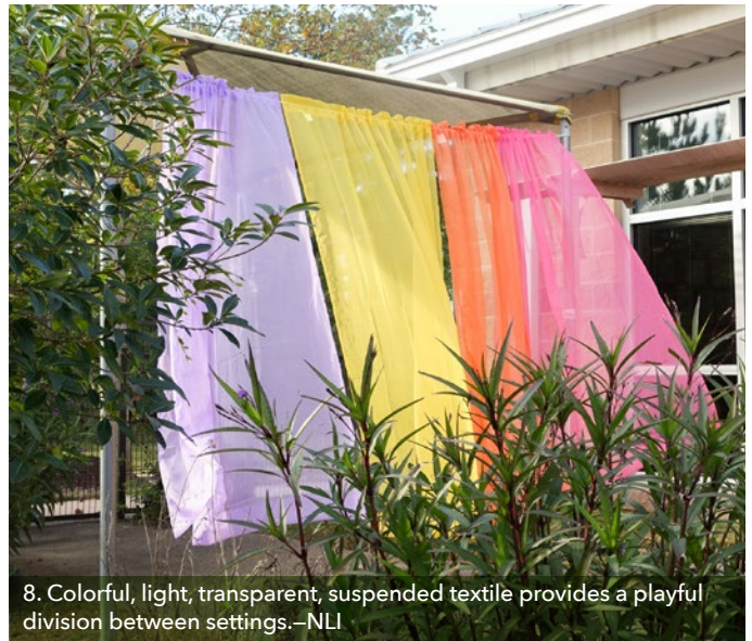
8. Colorful, light, transparent, suspended textile provides a playful division between settings. –NLI

Repurposing closed areas. If playground equipment use is not allowed during COVID-19, parts of the setting may be used while still following the rules. Settings with movable features and large use-zones, like swings, may be repurposed for other activities once swing seats have