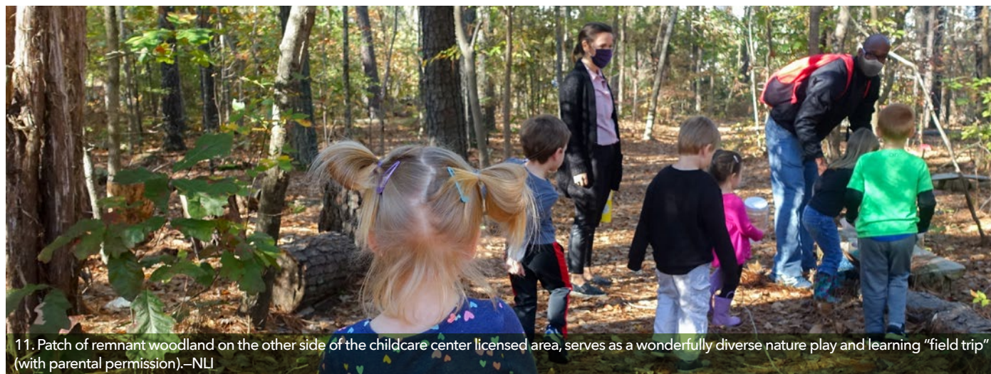
11. Patch of remnant woodland on the other side of the childcare center licensed area, serves as a wonderfully diverse nature play and learning "field trip" (with parental permission).—NLI