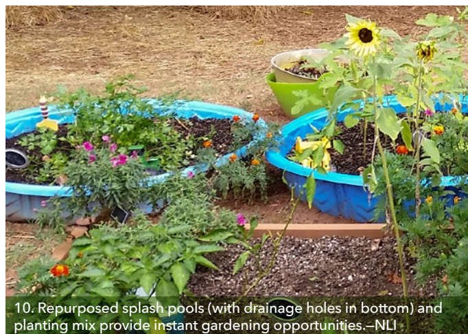
10. Repurposed splash pools (with drainage holes in bottom) and planting mix provide instant gardening opportunities.

Disclaimer: The Natural Learning Initiative (NLI), NC State University, the National Wildlife Federation, their partners, and supporting entities assume no responsibility for consequences arising from physical interventions using information contained in this document. Under no circumstances will liability be assumed for any loss or damage, including without limitation, indirect or consequential, incurred during installation, management, and use of such interventions. Highly recommended is adherence to relevant local, state, and national regulatory requirements concerning but not limited to health and safety, accessibility, licensing, and program regulation.