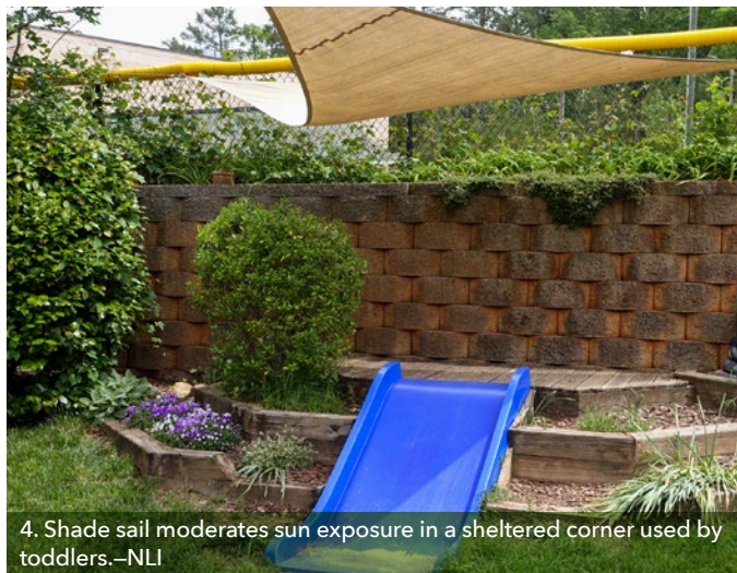
4. Shade sail moderates sun exposure in a sheltered corner used by toddlers.—NLI

Shade/rain cover. While sunlight can play an important role in deactivating the virus that causes COVID-19, over-exposure to UV rays is itself a health risk. Sun must be balanced with shade, which is crucial for summer comfort. Balance can be created with scattered patches of shade that protect children, while allowing sun to penetrate. Although tree planting is a long-term shade solution with added educational value, during the pandemic, a mix of shade sails, tents, umbrellas, pergolas, arbors, and roof structures can provide protection from sun, rain, and wind (4, 7).