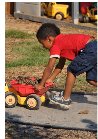
4. Pathways promote physical activity.