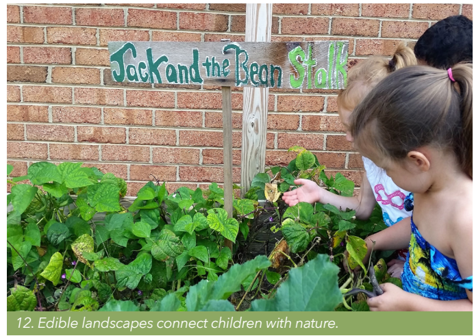
12. Edible landscapes connect children with nature.