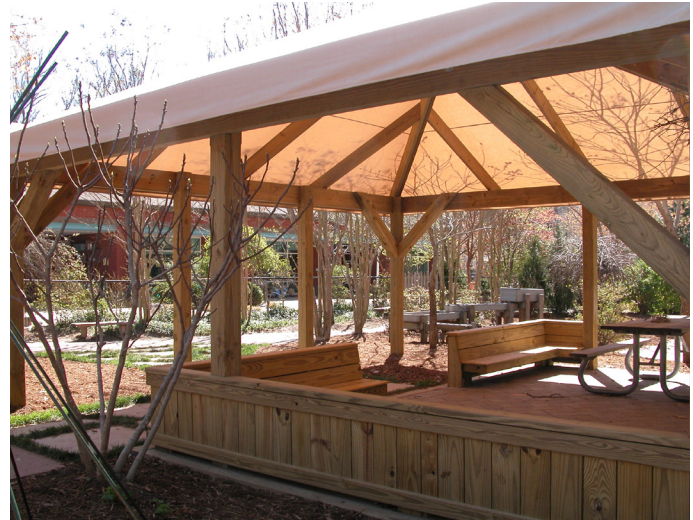
1. A covered open indoor-outdoor transitional space.