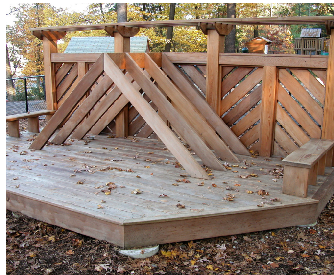
6. A versatile play deck.