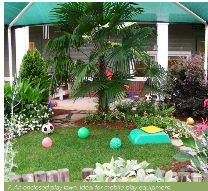
7. An enclosed play lawn, ideal for mobile play equipment.

equipment that require a soft surface (Figure 7). Lawns can accommodate social gatherings such as story time and offer a place for simply relaxing. Key considerations include: