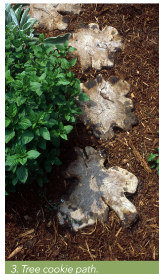
3. Tree cookie path.