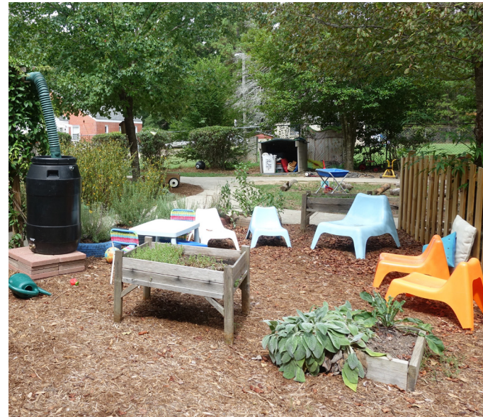
5. A gathering space adjacent to active play settings.

Multi-purpose lawns support high-energy group games, water play, and the exuberant joy of running – activities that promote cooperation and gross motor development. Lawns provide an ideal space for play with balls and other types of mobile