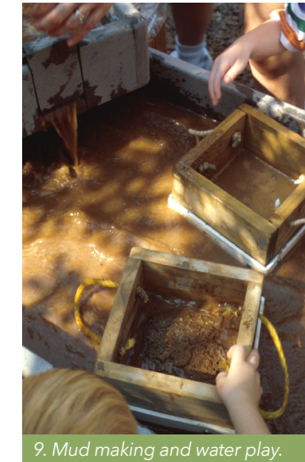
9. Mud making and water play.