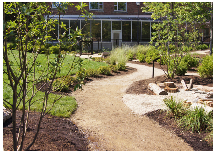
2. A primary pathway with adjacent plantings and settings.