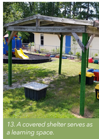
13. A covered shelter serves as a learning space.