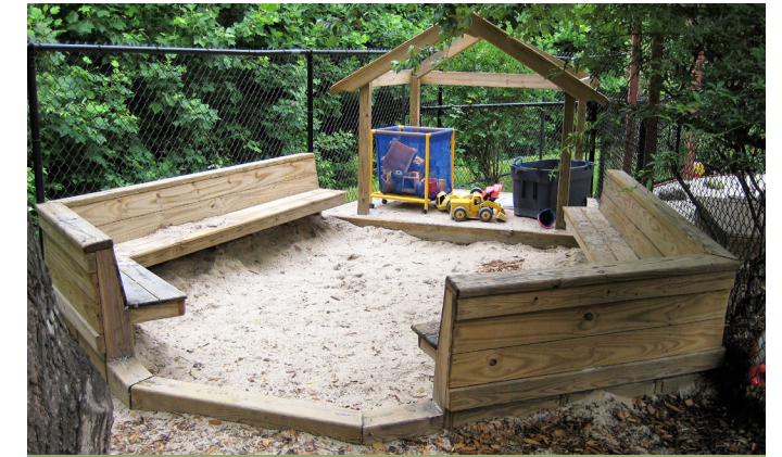
8. An enclosed sand play area with interior benches.