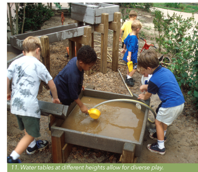
11. Water tables at different heights allow for diverse play.