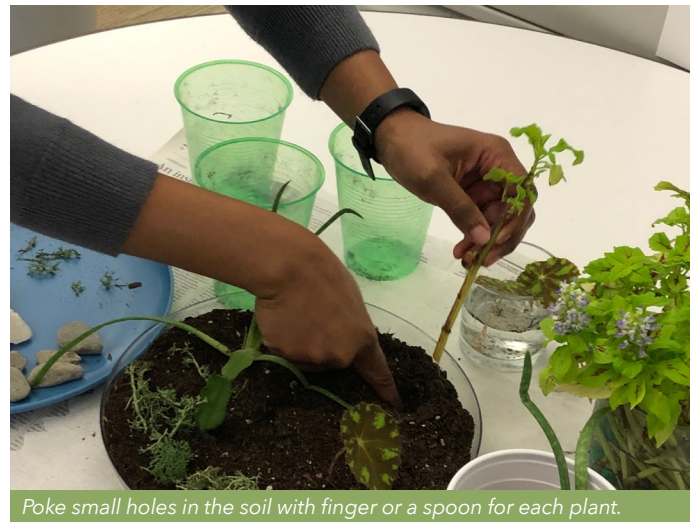
Poke small holes in the soil with finger or a spoon for each plant.