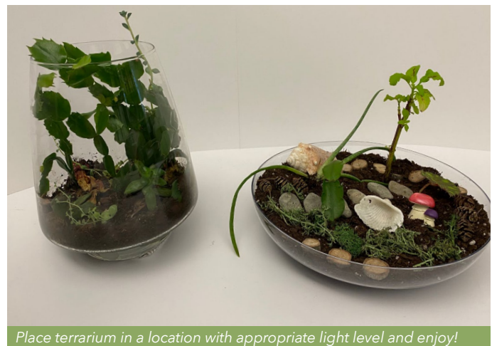
Place terrarium in a location with appropriate light level and enjoy!