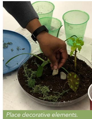
Place decorative elements.