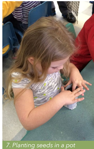
7. Planting seeds in a pot