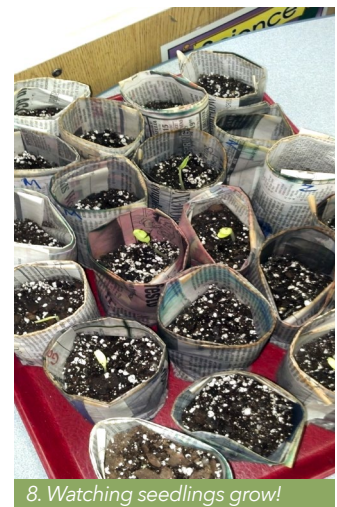
8. Watching seedlings grow!

Disclaimer: The Natural Learning Initiative (NLI), NC State University, its partners, and supporting entities assume no responsibility for consequences arising from physical interventions using information contained in this InfoSheet. Under no circumstances will liability be assumed for any loss or damage, including without limitation, indirect or consequential, incurred during installation, management, and use of such interventions. Highly recommended is adherence to relevant local, state, and national regulatory requirements concerning but not limited to health and safety, accessibility, licensing, and program regulation.