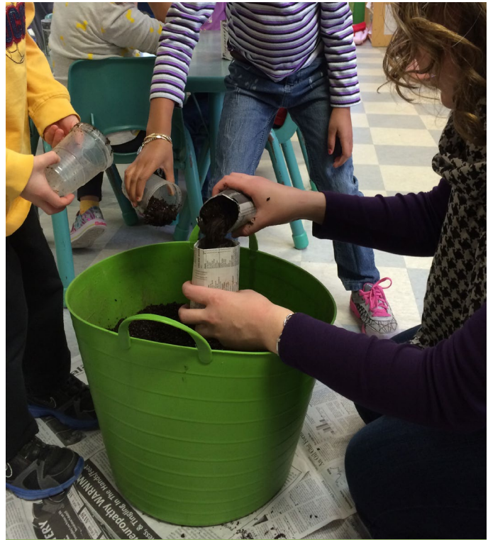
6. Adding potting soil to the newspaper pots

Keep a record of how long it takes seedlings to sprout. When ready, transplant pots to a raised bed, container (see InfoSheet: Growing Edibles in Containers ), or directly in the ground. Masking tape is not bio-degradable, so be sure to remove it before transplanting seedlings.