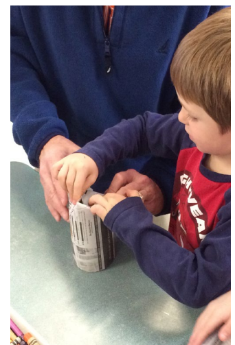
5. Folding pot rim