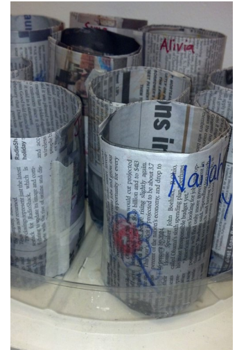
1. Completed pots in trays