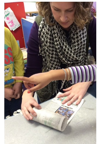
3. Rolling newspaper strips